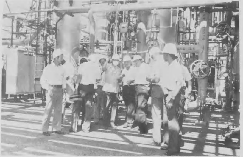
The course participants here get a demonstration of H 2 S and noise measurement at the Fuel Gas Scrubber Unit.